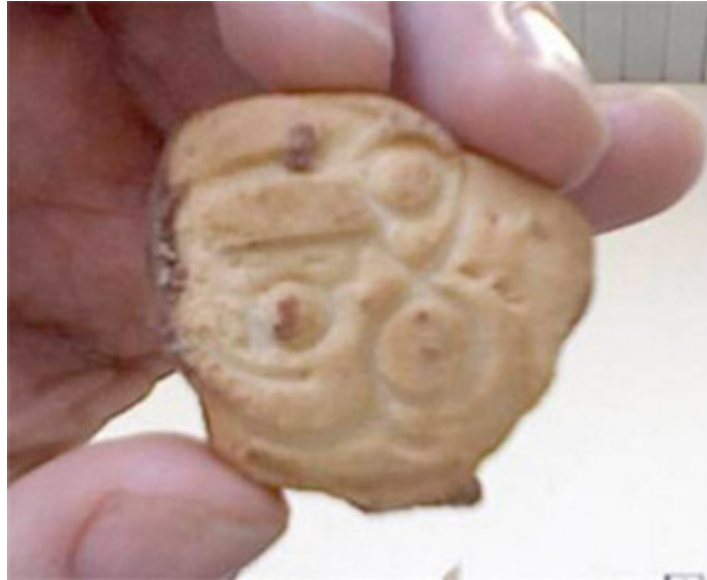
Illustration 2. Image of an 'indeterminate biscuit' taken from University web site, which includes the caption: "What on Earth is this???? Found in a package of Cadbury's Festive Friends chocolate biscuits in the office this afternoon. What on earth is it supposed to be? Santa? Reindeer? Snowman????? Do tell if you know!"

Visual indeterminacy then occurs when we are presented with images that are vivid and detailed yet resist easy or immediate identification, that is, when perceptual data cannot be integrated with cognitive data. There are numerous examples, not just in the history of art but in the most mundane aspects of everyday life. [2] Illustration 2 was recently added to a university bulletin board by a confused IT manager who wanted help in identifying what his Christmas-themed biscuit represented. [3]