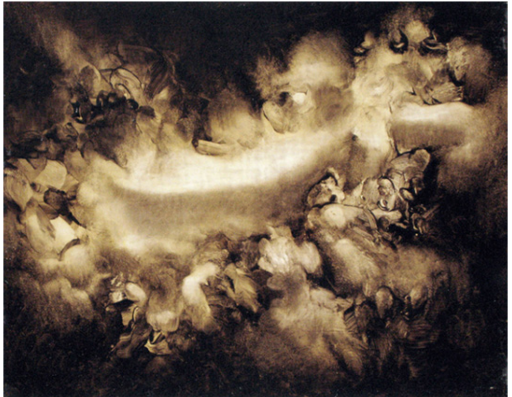
Illustration 3. Paralysis . Oil on panel, 27 x 33 cm, 2005. A painting by the author that suggests objects or scenes but resists easy or immediate identification. © Robert Pepperell , 2006. Private collection.